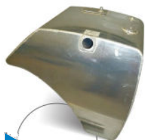
Wheel arch tank