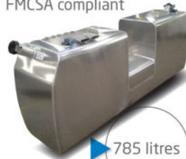
Left and right refueling FMCSA compliant