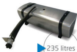
Chassis nested tank