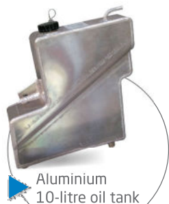
Aluminium 10-litre oil tank