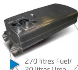
Combi fuel/urea tank