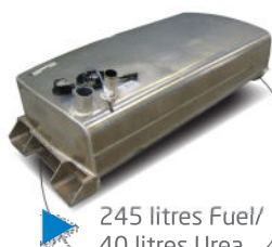
Combi fuel/urea tank