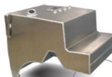
Wheel arch tank