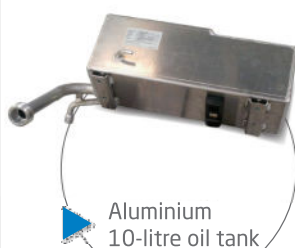
Aluminium 10-litre oil tank