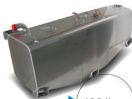
Aluminium fuel tank