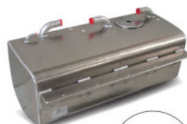
Grey water tank