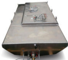
Catamaran fuel tank